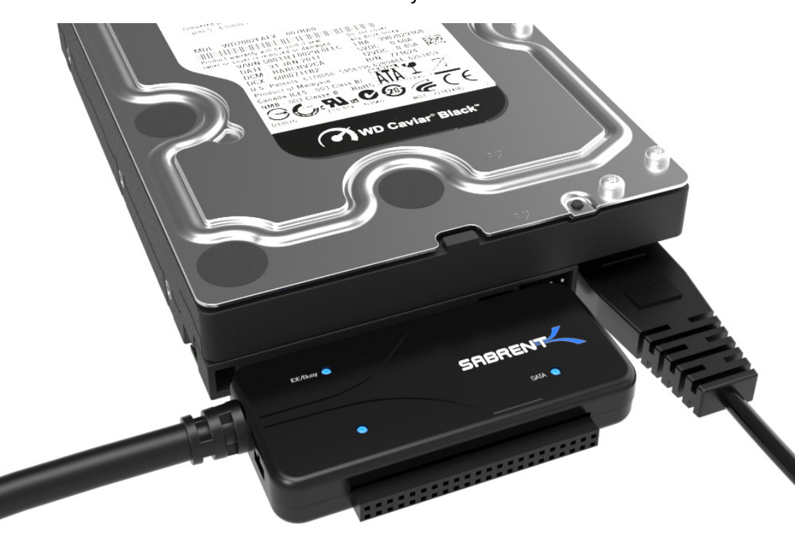
3- Connect the USB cable from the Sabrent converter to an available USB port on your computer

2-Connect the long 3.5 inch IDE connector to the pins on your hard drive Note the keyed pin and slot and make sure that the drive and the device line up properly and are securely connected